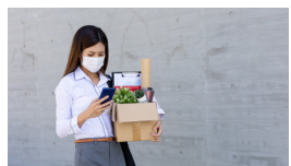
Inflation in Arizona