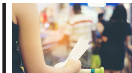
Inflation in Arizona