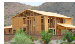
Arizona Housing Affordability

"According to a recent study from Common Sense Institute , inflation in Phoenix is 3% higher than anywhere else in the US, while Arizonans have reportedly faced a 10.9% spike in prices over the last year."