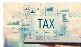
Arizona's New Tax Structure