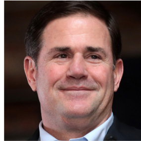
FORMER GOVERNOR DOUG DUCEY

The Legacy Award winner has established a life long record of fostering Free Enterprise and Individual Opportunity for Arizonans